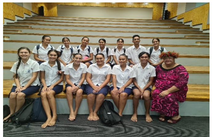
Level 2 Business Studies students of Tereora College