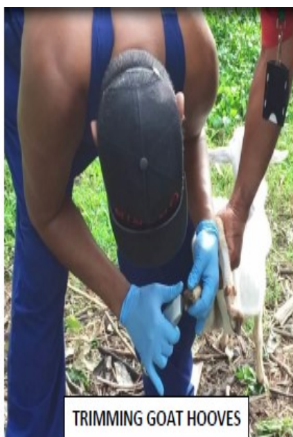
TRIMMING GOAT HOOVES