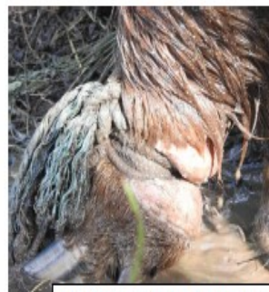
ROPE CUTTING INTO PIGS LEG