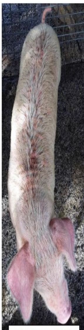
SYMPTOMS OF MANGE

The Ministry plans to hold this similar program for Pa Enuu.