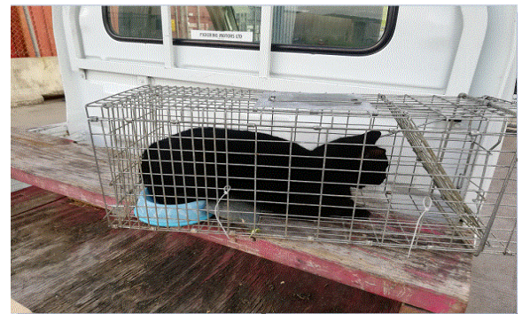
Above: The stowaway waiting to be transported to Te Are Manu

The cat was then transported to Te Are Manu Veterinary Clinic and euthanized.