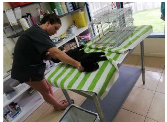
Above: The stowaway is euthanized

Meitaki maata to the team for undertaking this task.