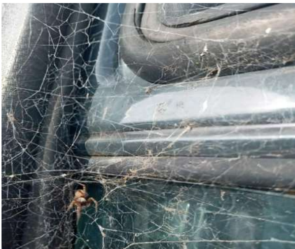
Above: Spiders spotted nesting outside of the excavator.