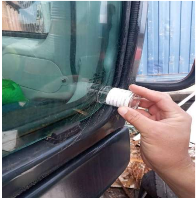
Above: Biosecurity officers capturing the spiders in vials.

Overall, 11 x spiders were found and destroyed.