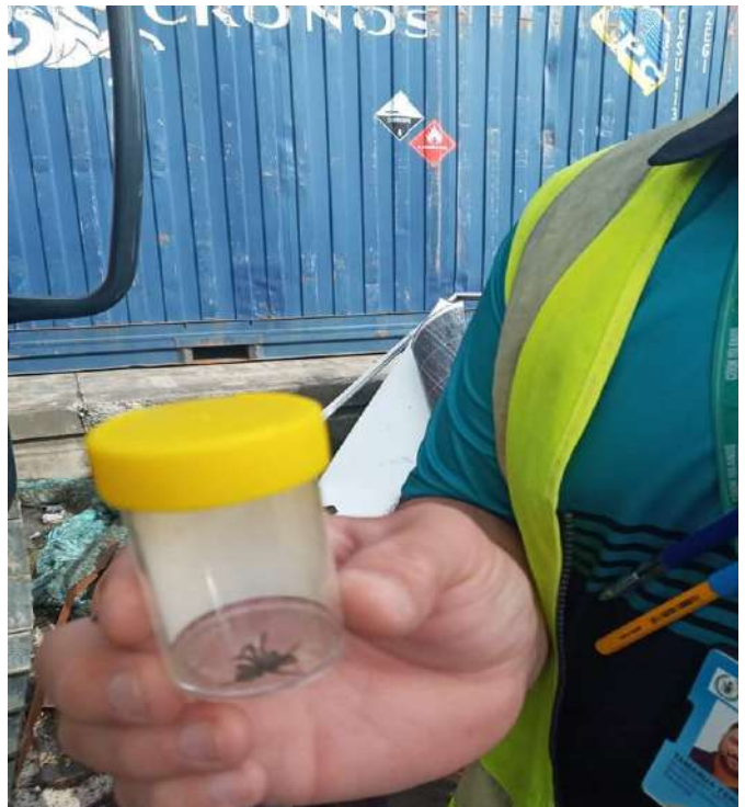
Below: Spiders were captured and sealed within vials that were sprayed with permethrin. Overall, 11 x spiders were found.